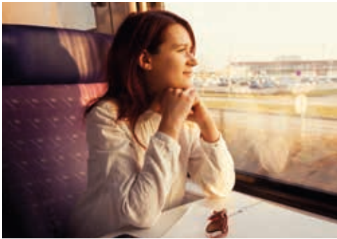
Capital connections Three Bridges station, with over 300 parking spaces, has fast and frequent services to London stations in the west end and City.

Brighton is along the A23, and in under half an hour you can be sitting in a beachfront café, coffee in hand, the sea on the horizon, or walking North Laine in the heart of Brighton's cultural quarter. The city of Brighton and Hove has its own calendar of annual events, from the Brighton Fringe and Brighton Festival to the quirky March of the Mermaids and many more. And in-between capital and coast, at Woodgate you can enjoy places including traditional Sussex villages, handsome market towns like Horsham or days out like the Bolney Wine Estate, Wakehurst botanic garden or Nyman's National Trust.