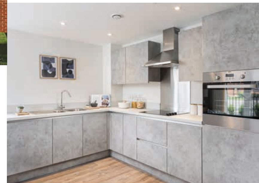
Carina apartments, Alphium.